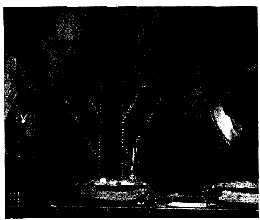
Cardinal Daniel DiNardo chants the Preface dialogue during the 2009 NPM National Convention.

a slight downward "turn and return" midway through the phrase ("Holy Spirit");